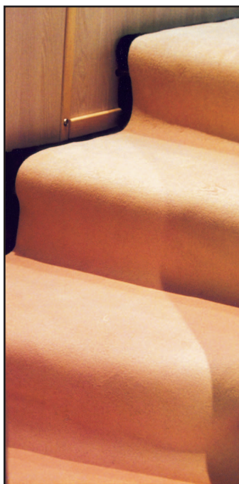
Conforms To Carpeted Stairs For Sure Footing

At last, you can save your carpets from traffic damage and wet weather without the hassle of stiff, bulky coverings. CarpetSaver is made of soft, durable cotton blend foam-backed fabric that grabs debris and water so it won't be tracked throughout the cabin. Great for home and RV too!